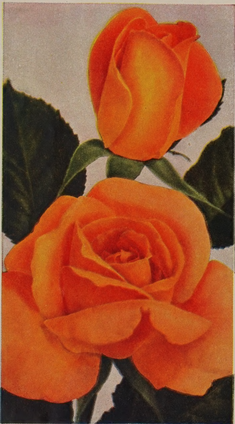
FRED EDMUNDS—$2.00 each; 3 for $5.00

MAJOR SHELLEY —Plant Pat. 447. A grand deep scarlet rose beautifully formed. Long-stemmed, vigorous upright grower, excellent foliage. $1.00 each; 3 for $2.50.